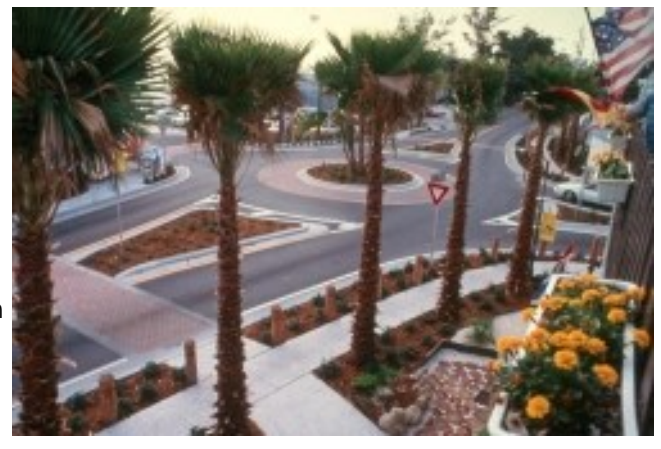
An appealing, pedestrian-friendly roadway changed residents' perceptions of Fort Pierce's waterfront and historic downtown.

Follow this link to learn about pedestrian and bicycle planning and design issues that should be considered when reengineering streets for traffic calming projects: http://www.pedbikeinfo.org/training/gettraining.cfm