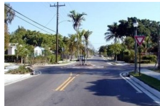
A traffic-calming roundabout and fresh streetscaping transformed this West Palm Beach neighborhood as well as the street.