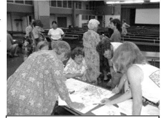
A collaborative planning process has many benefits: it creates relationships and buy-in, fosters a sense of community, and itself may help to reduce crime.

The volume of traffic on a street influences the quality of neighborhood life. In 1969 in San Francisco, the Urban Design Group surveyed streets,